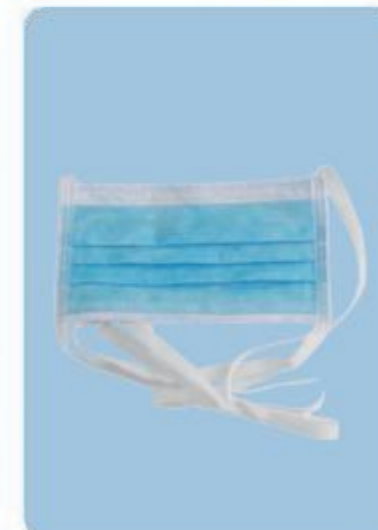
Tie On Face Mask

Material:SBPP+MBPP+SBPP Color:Blue, White ,Black, Green etc Size:17.5*9.5cm Style:Ear Loop Standard Packing:50pcs/box, 40boxes/ctn, 2000pcs/ctn. Application: Widely used for Medical/ Industrial/ Food/ Beauty/ Cleanroom/ Personal, etc.