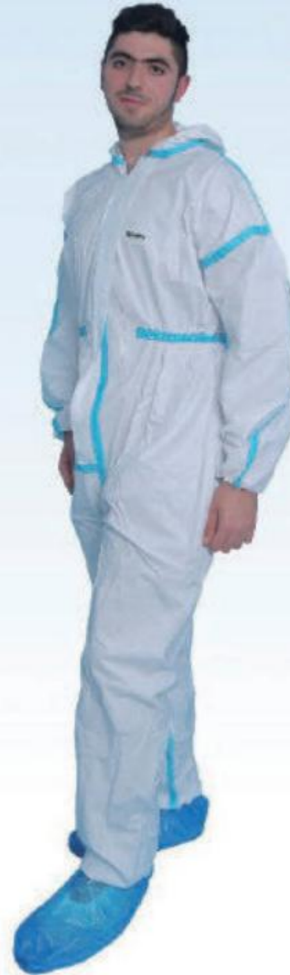
With Seal tape microporous coverall