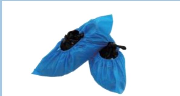
CPE Shoe Cover

Material:SBPP Color:Blue Weight:20-40gsm Size:15*40cm,17*40cm,19*40cm Style:Anti-slip, Normal Standard Packing:10pcs/roll, 10rolls/bag, 2000pcs/ctn . Application:Hospital, Clean rooms, labs, household, industry