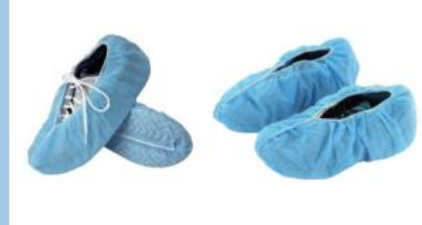
Hand Made Shoe Cover

Material:SBPP Color:Blue Size:15*40cm,17*40cm,19*40cm Style:Anti-slip, Normal Weight:20-40gsm Standard Packing:10pcs/roll, 10rolls/bag, 2000pcs/ctn . Application:Hospital, Clean rooms, labs,household, industry