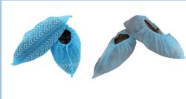
Machine Made Shoe Cover

Material:SBPP Color:Blue Size:15*40cm,17*40cm,19*40cm Style:Anti-slip, Normal Weight:20-40gsm Standard Packing:10pcs/roll, 10rolls/bag, 2000pcs/ctn . Application:Hospital, Clean rooms, labs,household, industry