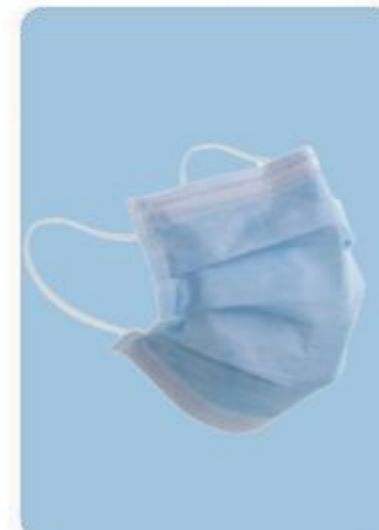
Ear Loop Face Mask

-NO:BST-06V -Material: -PP non woven 40g/m2 -Active carbon 50g/m2 -Filter paper 40g/m2 -200g/m2 needle-punched cotton